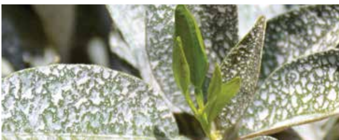
Figure 1. Surround on citrus leaves