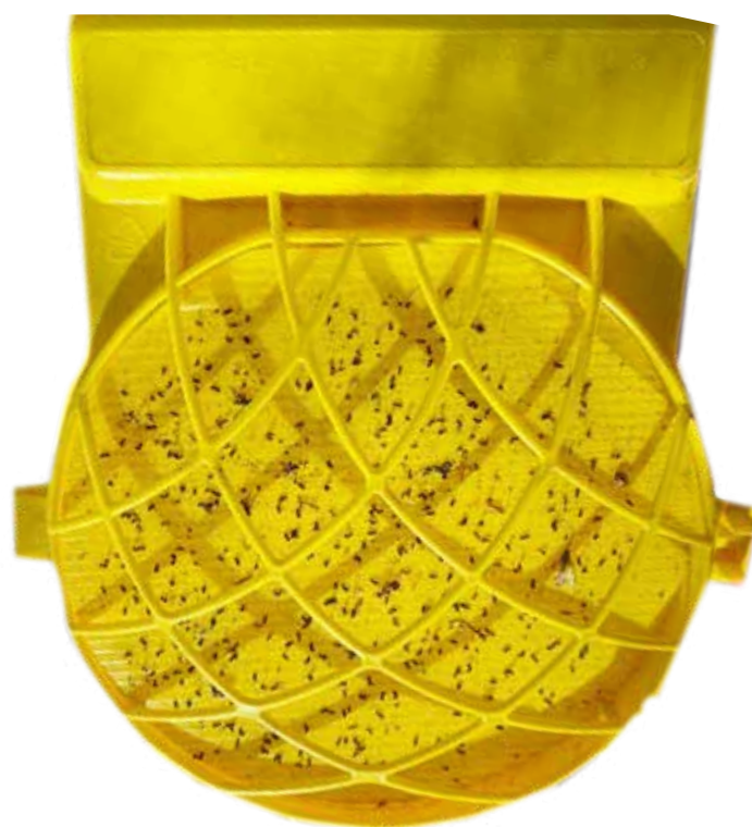
Figure 3. CGW on a Fruition Garden Citrus Gall Wasp Trap

Fruition Garden Citrus Gall Wasp Traps can be used to monitor for wasp emergence in the spring. CGW emergence is based on a measure of day degrees, generally from June 1 st . In the northern citrus areas, emergence will occur earlier than in the southern areas, but it can vary each year. A tool to accurately indicate emergence is a valuable resource in the management of CGW. The patented lure system in Fruition Garden Citrus Gall Wasp Traps is designed to attract adult CGW