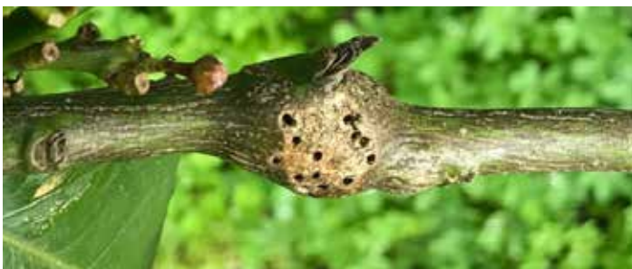
Figure 2. Gall with emergence holes